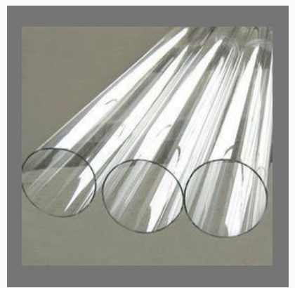
Borosilicate Plain Glass Tube