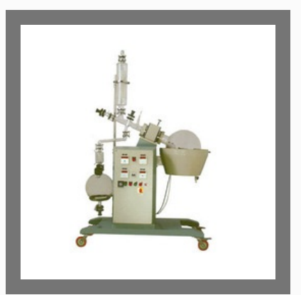
Rotary Film Evaporator