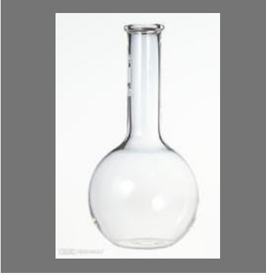
Borosilicate Glass Flask